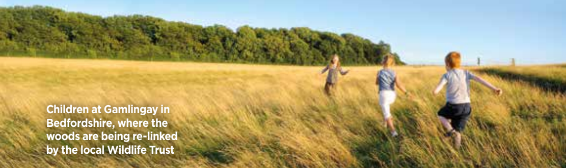
Children at Gamlingay in Bedfordshire, where the woods are being re-linked by the local Wildlife Trust

The causes of our separation from the rest of the natural world are many and complex. But nevertheless future generations need to love wildlife – for its own sake and for theirs.